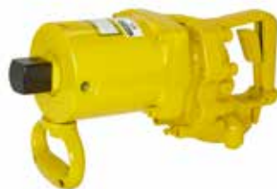
IW24 (NON CE)

The STANLEY IW Series of tools are medium to extreme duty square drive impact wrenches designed for some of the toughest underwater bolting applications. Powered by a integral STANLEY Hyrevz motor, our impact wrenches have an impact intensity ranging from 250 ft lbs of torque to 3,500 ft lbs of torque. Designed to run from a wide range of hydraulic circuits, this wrench allows underwater bolting in the most extreme applications. Hi-visibility yellow paint is standard.