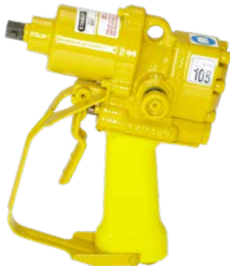
* whips and couplers are included