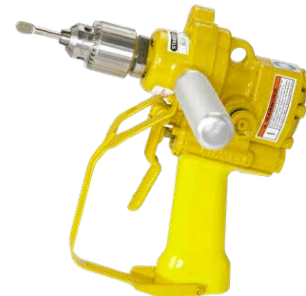
* whips and couplers not included