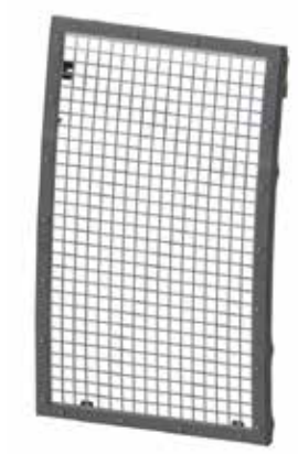
Wire Mesh Window Guard Pictured.