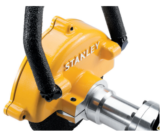
Adjustable Front Handle