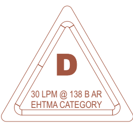
Circuit Type D Sticker 11207