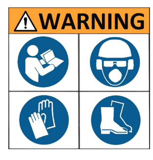
28409 Composite Sticker